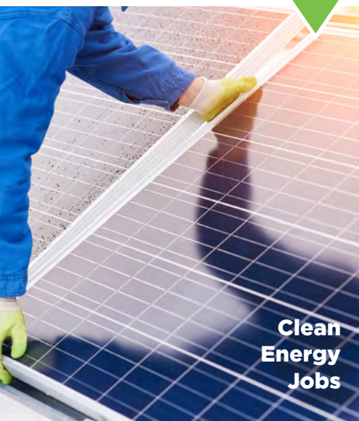
Clean Energy Jobs

With your support, we are confronting climate change head-on so that we can all look our children and grandchildren in the eyes and honestly say we did EVERYTHING in our power to ensure a healthy Ohio.