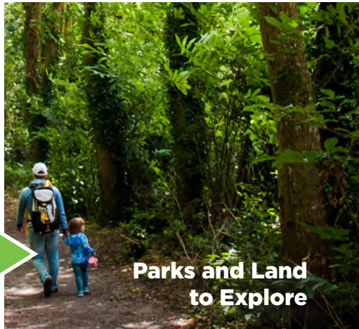
Parks and Land to Explore

THIS SHOULD BE THE OHIO THAT OUR CHILDREN KNOW.